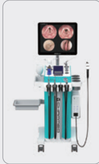
▲ XU1 SMART+V1 SMART