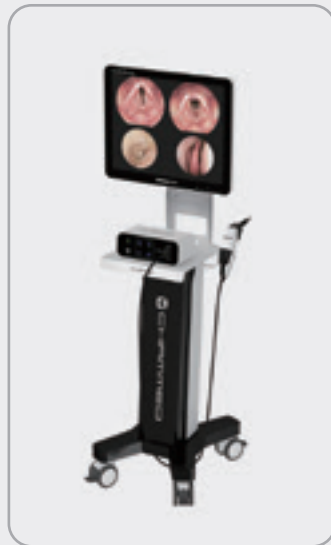
▲ V1 SMART CART+V1 SMART MINI