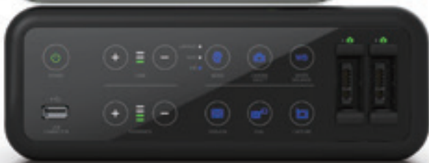
◀ V1 SMART