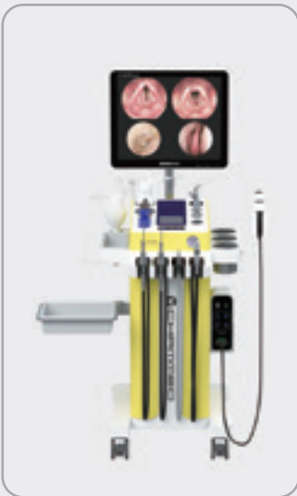
▲ XU1 SMART+V1 SMART MINI