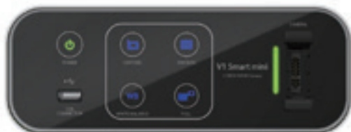
◀ V1 SMART MINI

The endoscopic system can be configured on the workstation for the best use.