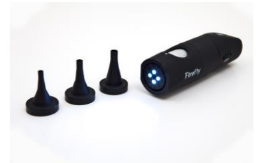
IMAGE AND VIDEO CAPTURE

DE570 empowers healthcare professionals with a whole new perspective. Its advanced technology can quickly provide a high-definition image for quick and accurate diagnosis.